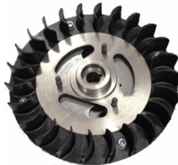
600535 for CDI (NEW)

*Important: R-667NS Flywheel/Magneto/Fan assemblies for POINT ignition (801164) are available in limited quantities . Once the stock is depleted, the item will no longer be available due to obsolescence of magneto tooling.